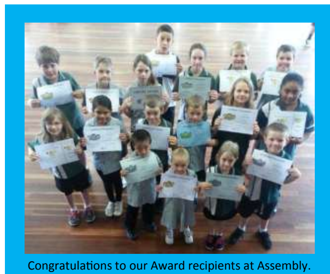
Congratulations to our Award recipients at Assembly.